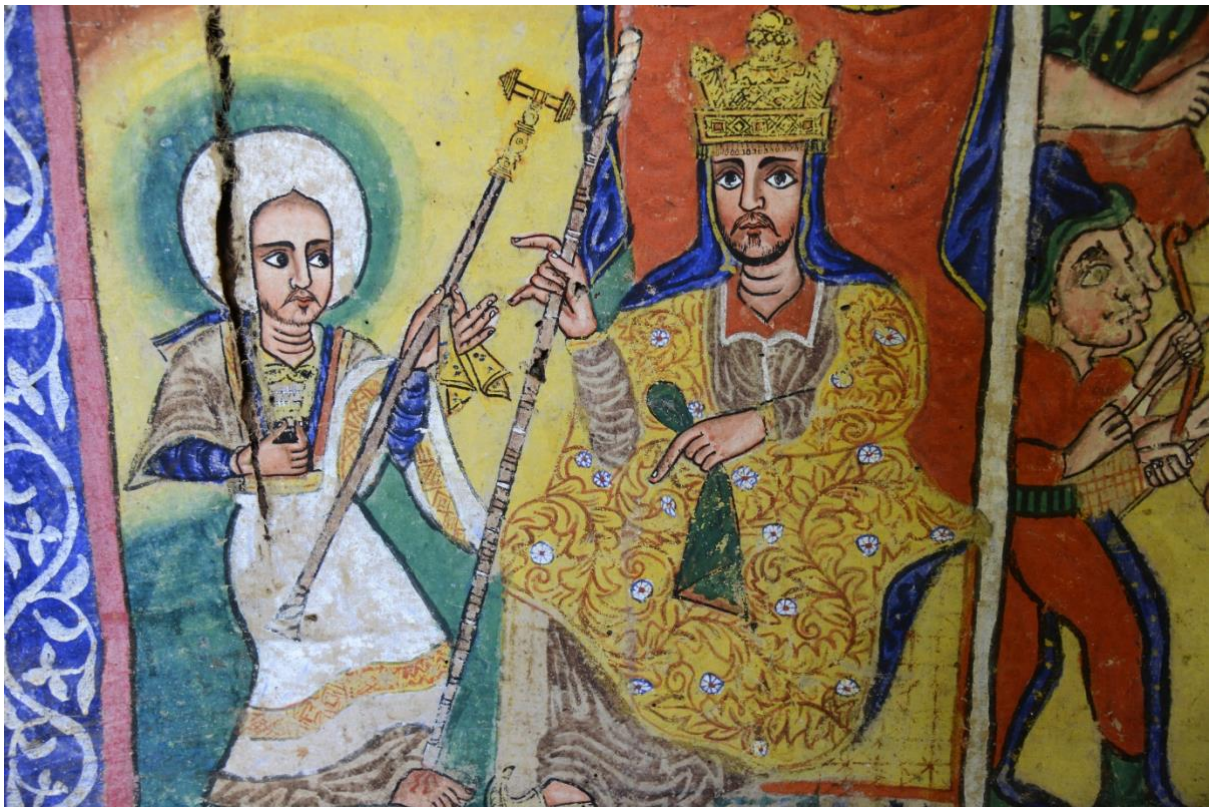
EZANA OF AKSUM