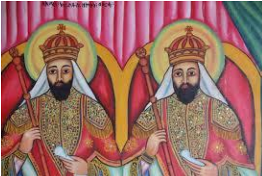
Ezana and Saizana ~ Abreha and Atsbeha

Ezana and Saizana were eventually baptised with the names Abreha and Atsbeha, respectively (these are the names of the two kings recorded in the 'King's List')