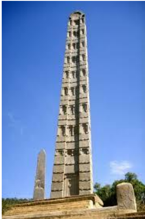
Ezana's Stele in Aksum