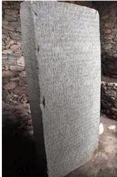
The Ezana Stone inscribed in Ge'ez, Sabaeen and Greek

The last inscription gives an account of an expedition against Noba now part of Sudan as well as the inhabitants of Kasu who also lived in the west.