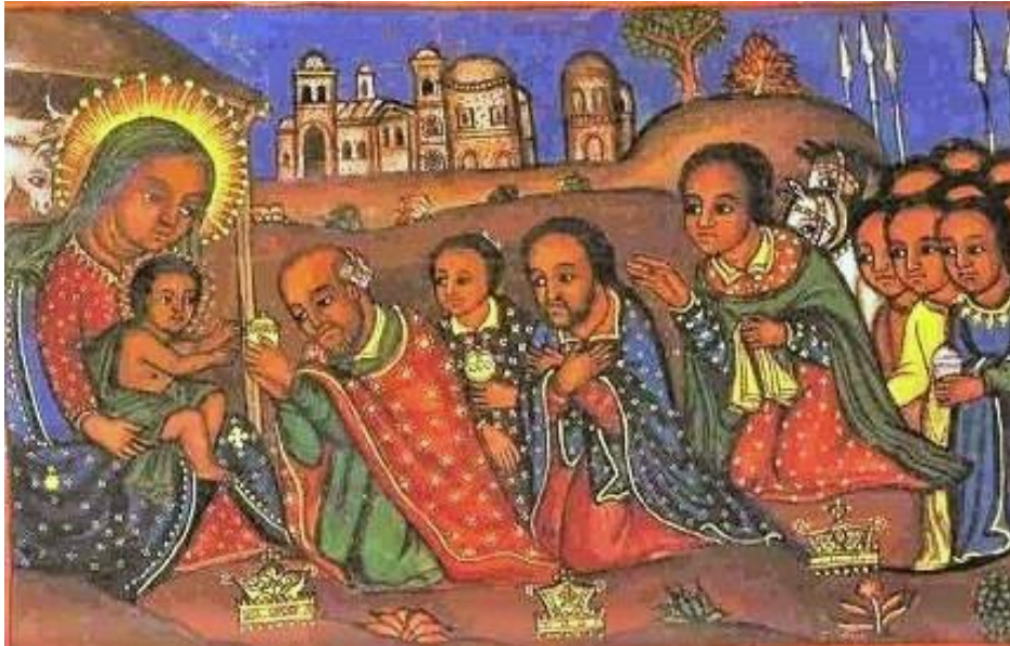
The Maji bring their gifts