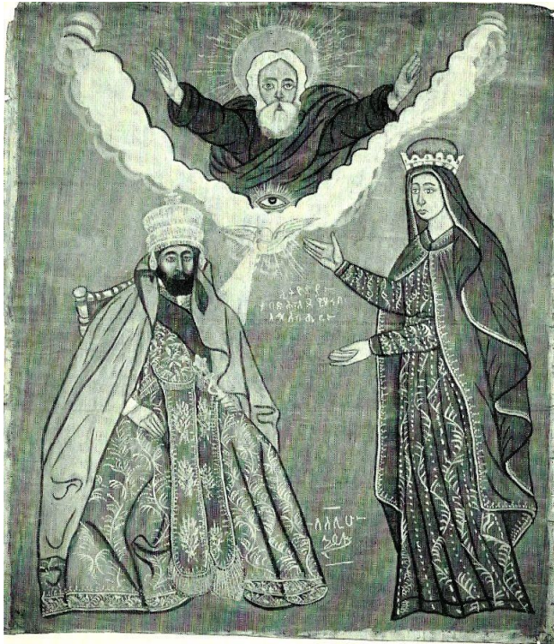
Ethiopia Stretches out her Hands unto God