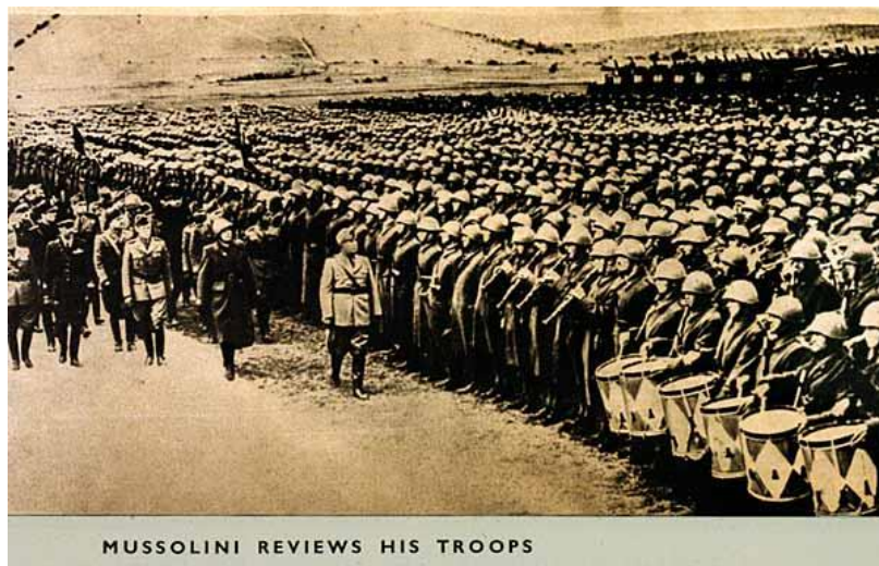
MUSSOLINI REVIEWS HIS TROOPS

Here we see the judgement of the Lord Yesus Kristos as King of kings and Lord of lords, nearing the end of time in the judgement of the nations. The beginnings of this soon coming glory of our Lord and His final judgment of the nations was preindicated on 30 th June 1936. His Imperial Majesty Emperor Haile Selassie 1 st , King of kings of Ethiopia, addressed the League of Nations and brought judgement upon it and the whole world for breaking international law by allowing the enemy of Ethiopia to come against her in violation of international treaties and the League’s covenant.