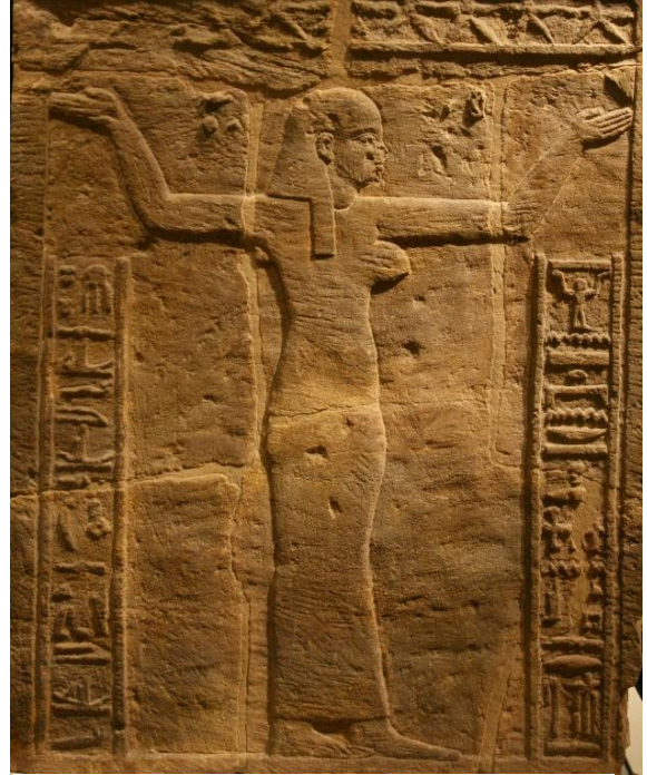
Kandaka, Queen of the Ethiopians

The Chronology goes on to say that on his return to Ethiopia, he taught others by word of mouth, the coming of our Saviour Yesus Kristus and baptised them. Those who were baptised had been living according to the Jewish law and ancient prescription by offering sacrifices to God. Ethiopia became a first-fruit generation of Kristus.