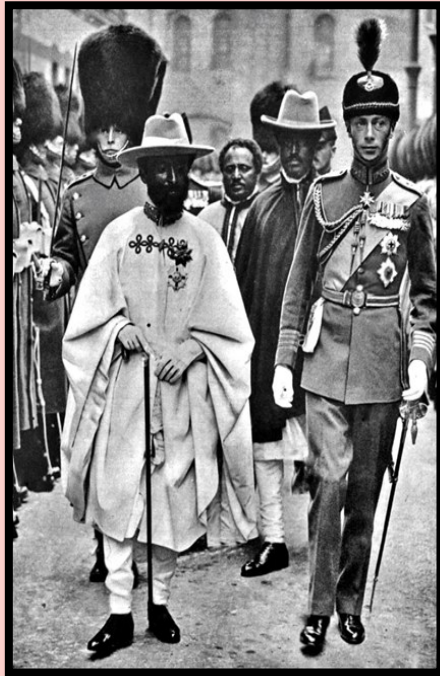
Ras Tafari with Duke of York visiting London 1924

Here is an extract from a speech given by the Vice-Chancellor of Cambridge University: